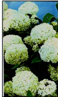
4 Annabelle Hydrangeas