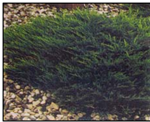
4 Low Junipers