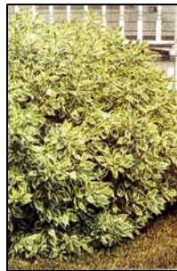
1 Red Variegated Red Twig Dogwood Shrub