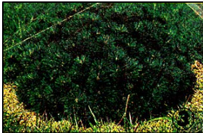
8 Dwarf Mugho Pines