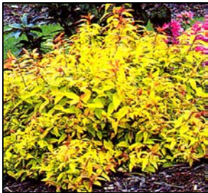
2 Dwarf Goldflame Spireas