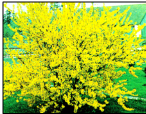
2 Dwarf Forsythias